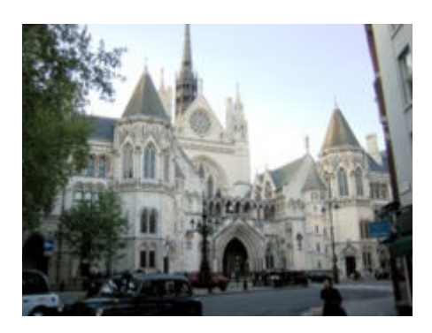
The Royal Courts of Justice

The 11 architects competing for the contract for the Law Courts each submitted alternative designs with the view of the possible placing of the building on the Thames Embankment. The present site was chosen only after much debate.