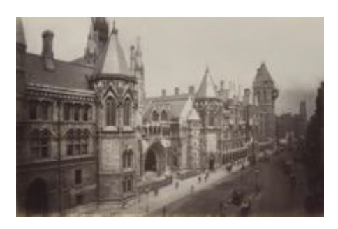
The Strand facade of the Royal Courts of Justice in 1890.

was officially opened by Queen Victoria on the 4 December 1882. Street died before the building was opened.