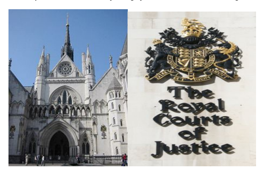
The main entrance

The Royal Courts of Justice , commonly called the Law Courts , is the building in London which houses the Court of Appeal of England and Wales and the High Court of Justice of England and Wales. Courts within the building are open to the public although there may be some restrictions depending upon the nature of the cases being heard.