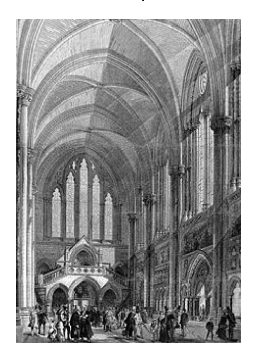
The Great Hall in 1882

The 11 architects competing for the contract for the Law Courts each submitted alternative designs with the view of the possible placing of the building on the Thames Embankment. The present site was chosen only after much debate.